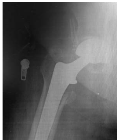
Figure 2. Postop. 3rd day