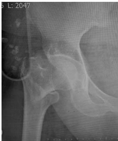
Figure 1: 76y

The mean follow-up period was 13.6 months for Group I patients and 14.3 months for Group II patients.