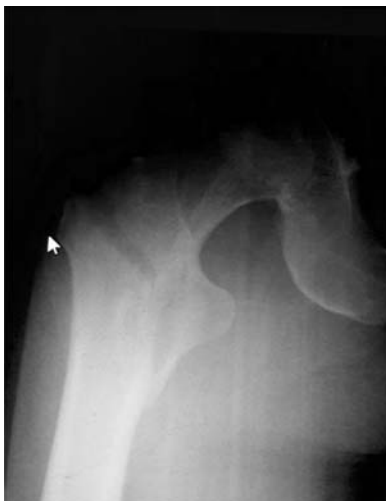
Figure 4. 70y m