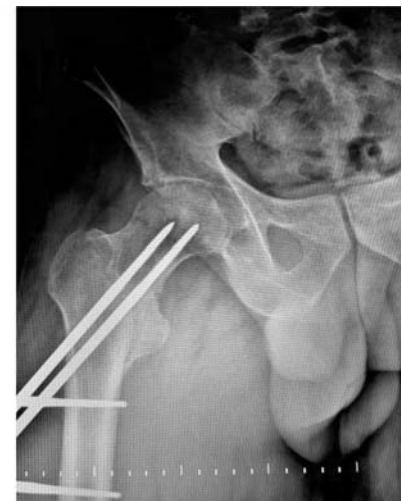
Figure 6. Postop 4th month