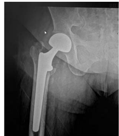
Figure 3. Postop 3rd month