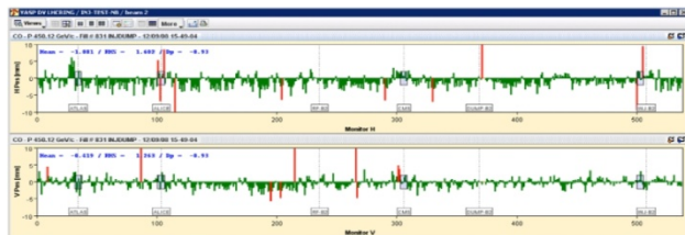
Figure 3: Best B2 closed-orbit as established on Friday 12th. Faulty monitors (red) are disregarded for the RMS calculation.

The best reference closed-orbit, established after beam capture, is shown in Fig. 3. The horizontal RMS orbit was 1.6 mm and the vertical was 1.3 mm. These were achieved by using a limited number of correctors. The analysis of the residual orbit suggests that by using more correctors one could easily improve the RMS errors by a factor 3-5 [6].