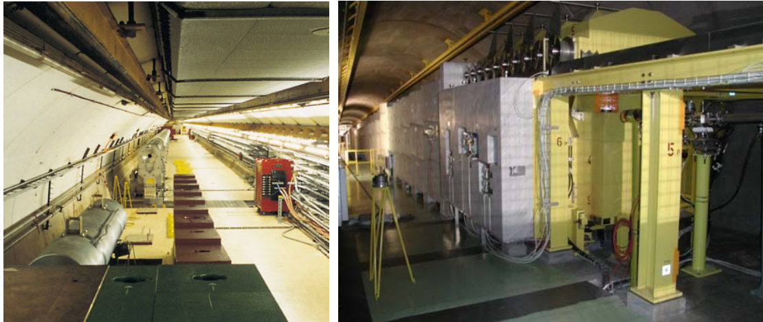
Figures 1 a-b: WANF (left) CNGS (right).

The second major improvement was the provision of a service side-gallery which gives access to the target chamber without exposing people to the most radioactive items in the chamber. This allows necessary equipment like pumps, cooling units, power supplies or cable trays to be installed in areas with much lower dose rates and activation and therefore significantly reduced radiation exposure during maintenance of these equipments. In addition, people making repairs on beam line components themselves can prepare the work in the service gallery and therefore minimizing the amount of time spent in the highest radiation environment. However, a future facility should not have straight connecting tunnels between the target cavern and the side-gallery but rather use a ‘three-leg’ design in order to reduce radiation streaming into the side-gallery.