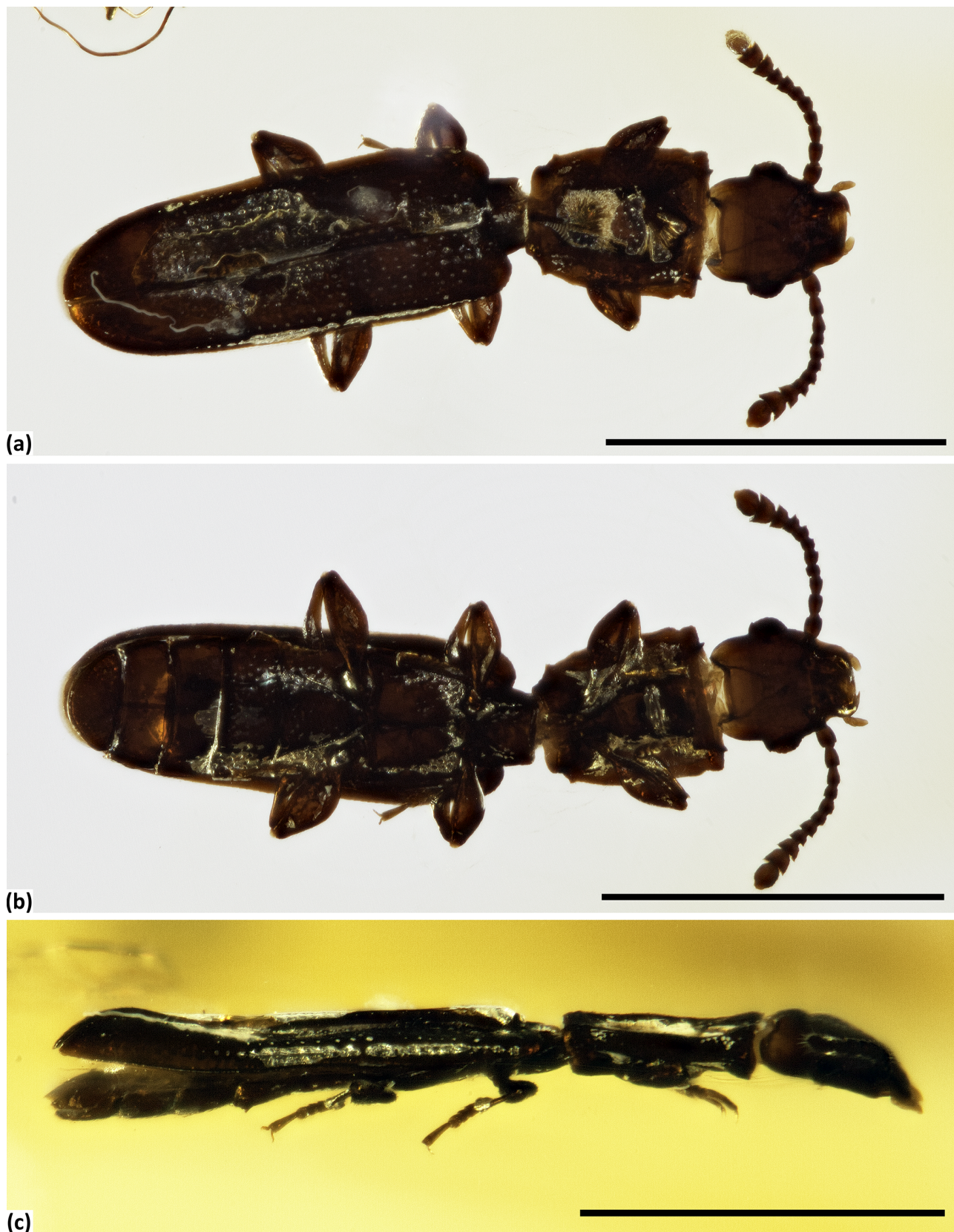
Figure 1. Cathartosilvanus siteiterralevis sp. nov., holotype, P3300.87 (RSM): (a) habitus, dorsal view; (b) habitus, ventral view; (c) habitus, lateral view. Scale bars = 1 mm.