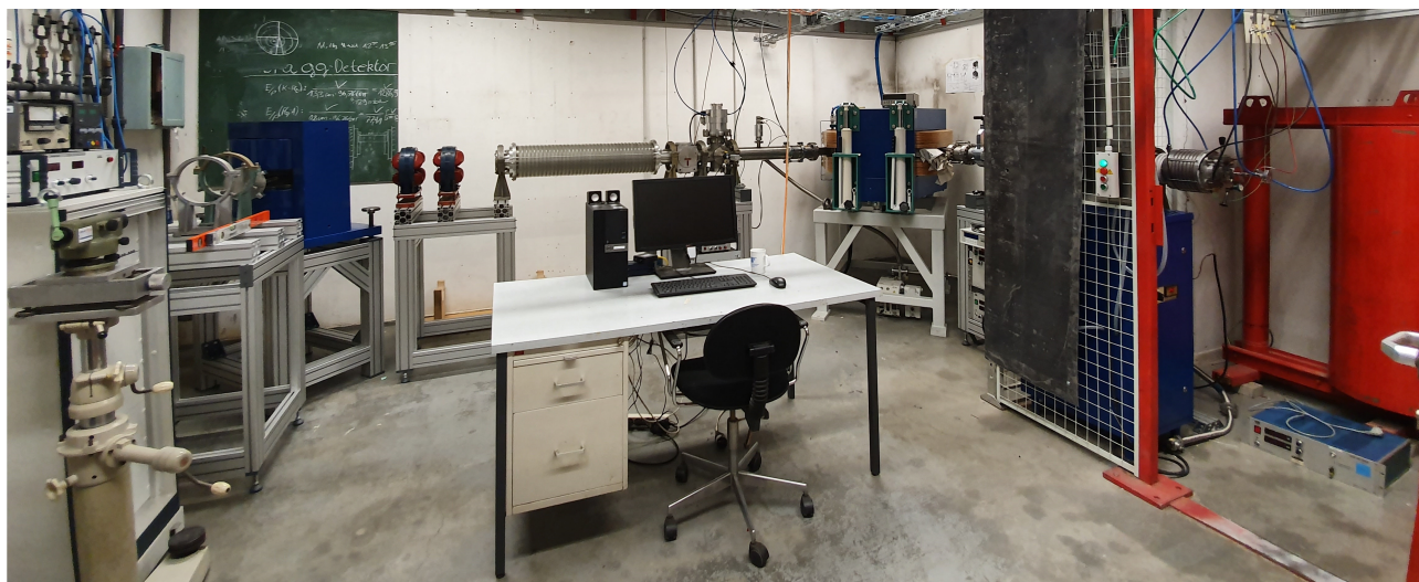
Figure 2. The new 100 kV Tandem accelerator. Shown is (from right to left): the ion source, the double focusing 90° analyzing magnet, \rho=500 mm, the 1 m acceleration tube (without grounded protection housing), the quadrupole doublet and the 90° analyzing magnet, \rho=190 mm. Beam line components between accelerator and second magnet had not been installed.

AMS project for quantification of ^{14}\text{C} content in reactor graphite by use of the new gas handling system. The accelerator can be installed independently to the other accelerators with its own \text{SF}_6 gas system, Fig. 3.