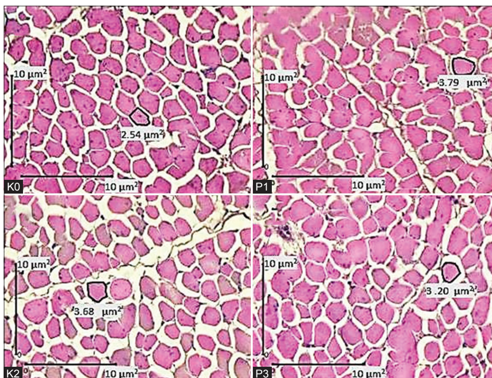
Figure-2: Sections of pectoralis muscle tissue of broiler chickens. K0=Control group with basal feed, P1=Chicks treated with basal feed+S. jaoensis (0.5% of feed), P2=Chicks treated with basal feed+S. jaoensis (1% of feed), P3=Chicks treated with basal feed+S. jaoensis (2% of feed). In the control, the myofiber area is smaller than that in chicks fed with S. jaoensis . Hematoxylin and eosin staining.