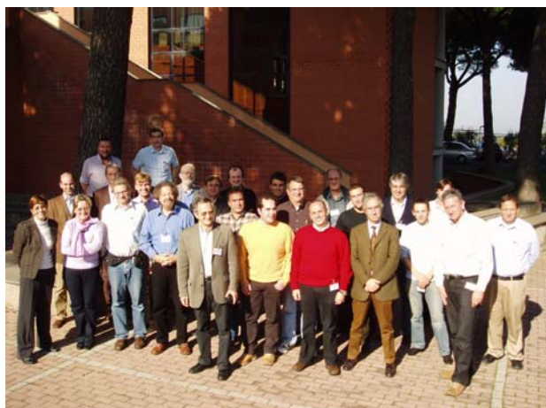
Figure 1: The IR'07 participants on the workshop site.

The IR'07 CARE-HHH-APD mini-workshop was organized at INFN Frascati from the 7th to the 9th of November 2007. The workshop was attended by 39 experts (Fig. 1), about half of whom came from CERN. The workshop scope covered the upgrade of the LHC interaction region (IR), the DAFNE IR upgrade, and plans for SuperB. More specifically, the key topics included the performance and limitations of the LHC-IR upgrade optics, the optimization of new LHC IR triplet magnets, the US-LARP magnet strategy (response to Lucio Rossi's "challenge"), heat deposition, early-separation dipoles, detector-integrated quadrupoles, crab cavities wire compensators and crab-waist collisions. The goals of IR'07 were threefold: (1) to narrow down the possible IR optics options and to converge on magnet parameters, (2) to identify the ingredients of the two LHC upgrade phases, and (3) to strengthen the collaboration with DAFNE/SuperB studies as well as to explore the applicability of advanced IR concepts to the LHC. The workshop web site http://care-hhh.web.cern.ch/CARE-HHH/IR07 comprises a link to the agenda and talks posted on INDICO.