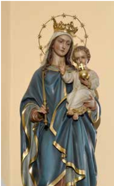
Pict. 1: Statue of St. Mary Queen of Heaven, made of the so-called 'stone material': product of Mayer'sche Kunst-Anstalt in Munich.