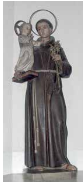
Pict. 2: Statue of St. Antony of Padua, made of gypsum plaster.