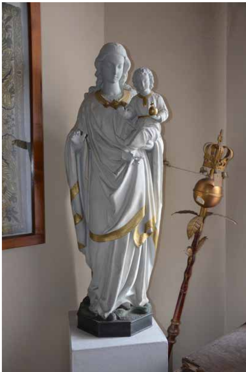
Pict. 9: Statue of St. Mary, made of moulding material (repainted white), produced (or sold) by Goerlich & Coch, Buch- & Kunsthandlung in Breslau. The statue belongs to the collection of Muzeum Archidiecezjalne in Wrocław.