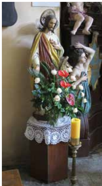
Pict. 8: Sacred Heart statue, made of the so-called 'stone material': product of Mayer'sche Kunst-Anstalt in Munich. The figure, located in the Catholic church in Jelonia Góra-Cieplice, Poland, seems to still function as an object of veneration.