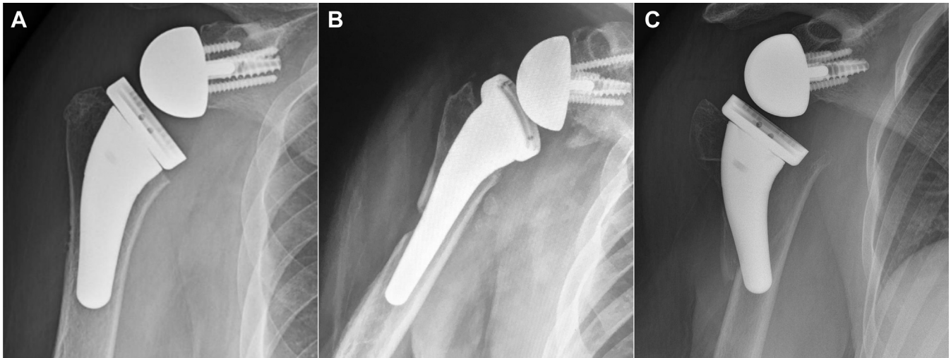
Figure 1 (A, B) Spectrum of cortical bone loss through the lateral cortex. (C) Periprosthetic fracture through the site of osteolysis.