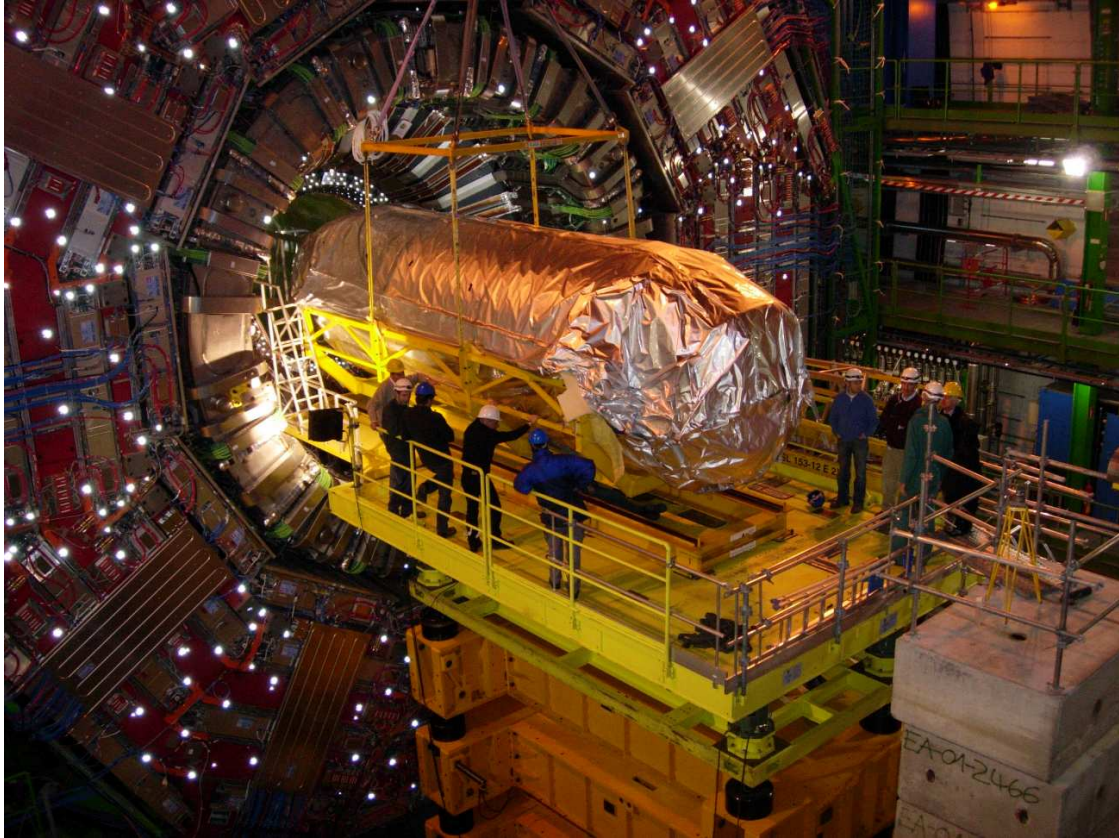
FIGURE 1. CMS inner tracker insertion in December 2007

the CMS electromagnetic calorimeter endcaps) and the detectors are now exercising their data acquisition and trigger systems using cosmic rays. One of the last big milestones for the CMS detector was the insertion of the inner tracking system in December 2007 (Figure 1).