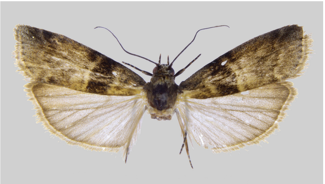
Figure 4. Elegia occultalis Plant, sp. nov. Paratype female, North Macedonia, 13.vii.2019. The slight yellowing of the forewings is a consequence of the specimen becoming “greasy”; in life, the wing colour is identical to that of the male.