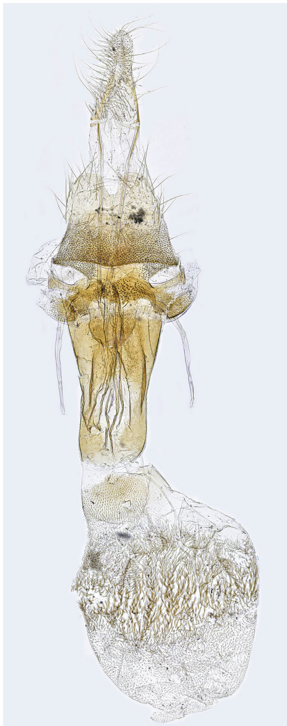
Figure 6. Elegia occultalis Plant, sp. nov. genitalia of paratype female. In euparal on glass slide, CP/1998/20, by CWP.