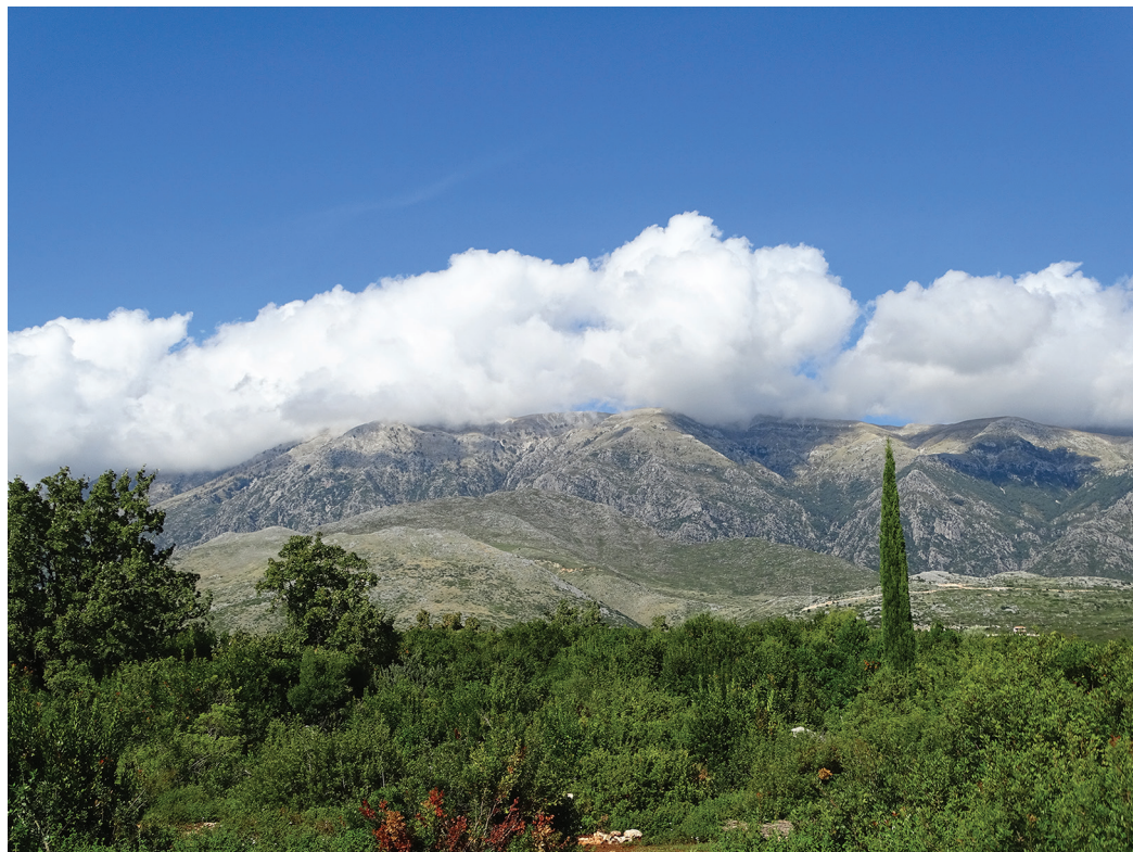
Figure 1. Habitat of Elegia occultalis Plant, sp. nov. Albania, coast below Ilias, near the St. Theodor monastery, 140 m. Maquis with Olea europaea L. (Oleaceae), Quercus macrolepis Kotschy, Q. coccifera L., Q. ilex L. (Fagaceae), Arbutus unedo L., Calluna vulgaris (L.) Hull (Ericaceae), Pistacia lentiscus L., P. terebinthus L. (Anacardiaceae), Cupressus sp., (Cupressaceae), Ficus carica L. (Moraceae), Cistus sp. (Cistaceae), etc.

as a result of further research, that the range of the new species overlaps geographically with that of E. iozona , then confusion between these two taxa is also likely to require genitalia examination for resolution. Separation from two recently described Turkish species is achievable by comparison of the shape of the gnathos, which is round in E. occultalis , spoon-shaped in feminina and ovoid, with an angular apex in saecula .