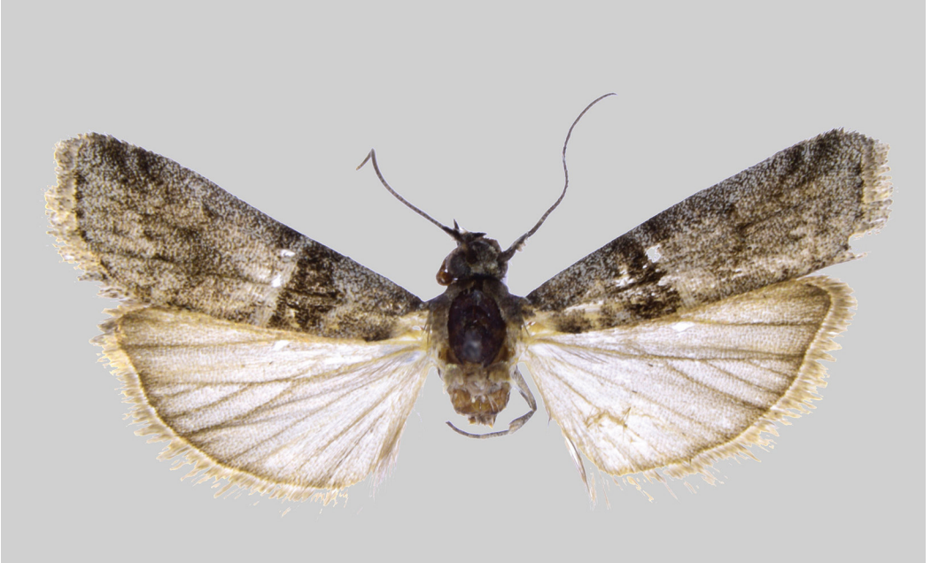
Figure 3. Elegia occultalis Plant, sp. nov. Holotype male, Albania, 15.v.2017.