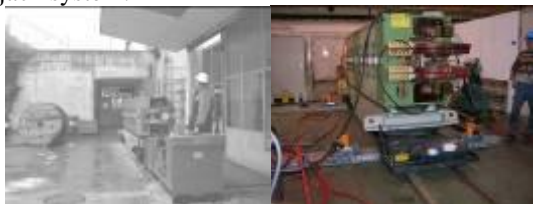
Figure 4: Transport and translation systems for PS magnets

For the positioning on the beam, the magnet is placed on transverse adjustable aluminium rails and pushed with a jack system.