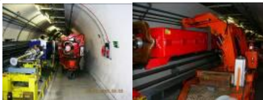
Figure 3: SPS magnet installation on the beam

The SPS magnets transport vehicle also combines transport and positioning of the magnet. With a 18 t payload and 1,20 m width, it allows a precise (less than 1 mm) positioning of the magnet on the beam, using two hydraulic arms.