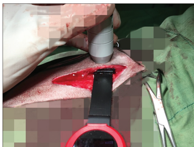
Figure-2: Measuring the mean output power using a power meter inserted inside the tissue.