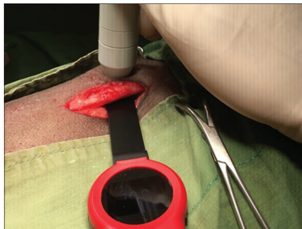
Figure-1: Demonstrating the power meter placement under skin-muscle tissue and measuring mean output power.

Descriptive analysis represented power penetration as mean (mean output power [MOP]) and standard deviation. The effect of laser operation mode (CW vs. PW), tissue thickness (air, skin, and skin-muscle), and tissue-laser probe distance on MOP was tested by three-way factorial analysis of variance (ANOVA) with blocking (dogs). If the overall effect was significant, we proceeded to do a one-way