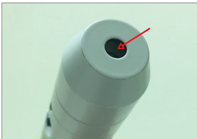
Figure-4: The converging probe for 830 nm with a hollow tip (arrow) and a small distance between incident light and the detector.