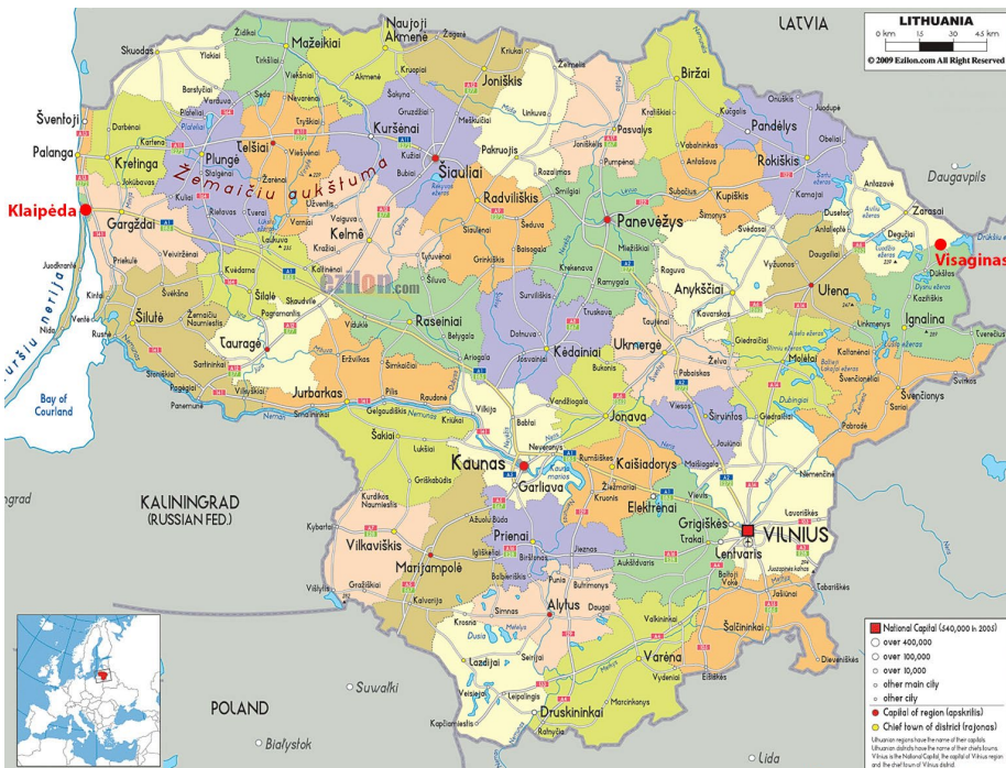
Fig. 2. Map of Lithuania

For checking efficiency of criteria system was selected hypothetical inland waterway in Lithuania (Fig. 2). It is planning to carry HW/OS from Klaipėda seaport to Visaginas.