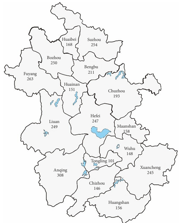
Figure 1. Sample trucks of each city in Anhui Province of China

To identify key factors to road freight overloading, dependent and independent variables need to be defined first. Dependent variables relate to whether a truck has previously had an overloaded trip. Thus, a binary dependent variable was used and defined as 1 = overload , 0 = not overload . Independent variables consisted of Vehicle Characteristics, OMs, and TI. VC included VT, VL, RL, Number of Axles (NA), Engine Power (EP) and Engine Displacement (ED). TI included Type of Goods (TG), Type of Transportation (ToT), Travel Mileage (TM), Fuel Consumption (FC), Freight Mileage (FM), FW and AHD. The definitions and descriptions of the 14 independent variables are shown in Table 2.