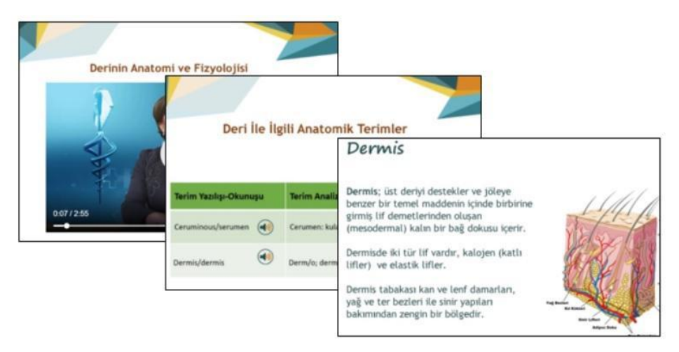
Figure 2. Interactive multimedia content.

In the first week of the semester, learners were introduced to the flipped classroom model and how it would work for their course. Since learners were familiar with the traditional instructional methods, a level of resistance to this new model was observed in the initial weeks of the course. In order to deal with this resistance, online discussion forums were held and students received feedback every week. In addition, participation in virtual classes and asynchronous activities were evaluated and bonus points awarded by the lecturer.