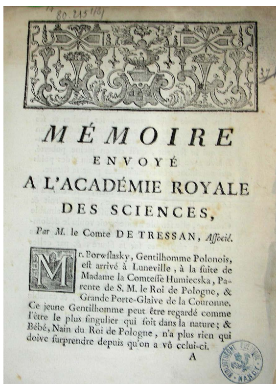
Figure 2. Page of Mémoires de Tressan sur les nains Bébé et Borwflasky envoyé à l'Académie royale des Sciences, Nancy

Tressan did not feel any sentiment for the dwarf: he considered him a degenerate with an undefined disease. Tressan also believed that the process of the maturation of his reproductive organs had caused a large defect and languishing of the body; he predicted his death before the age of 30 (Tressan 1759: 4–5; Liégey 1889: 142).