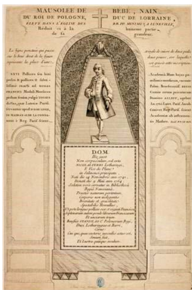
Figure 3. Dwarf Bébé (Nicolas Ferry). Tombstone in the church of the Friars Minor In Lunéville, unknown author, about 1765, copperplate, ribbed paper, Muzeum Narodowe w Krakowie, inventory No. III-ryc-37290

Church du Couvent des Minimes in Lunéville, (Figure 3) while the bones were deposited – as Benoît says – in the Royal Academy in Nancy for a short period of time (Benoît 1884: 115). The bones were intended to be researched further there, but King Stanislaw decided differently. He directed his scientific intentions to Paris and to the famous Count Buffon, a foreign member of the Society in Nancy since 1760 (Figure 4).