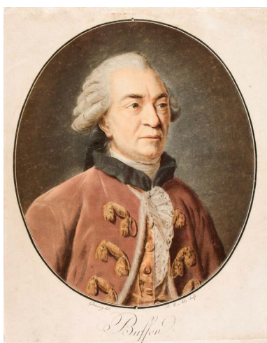
Figure 4. Buffon, Georges-Louis Leclerc, Muzeum Narodowe w Krakowie, inventory No. M.N.K. 03-ryc-3900