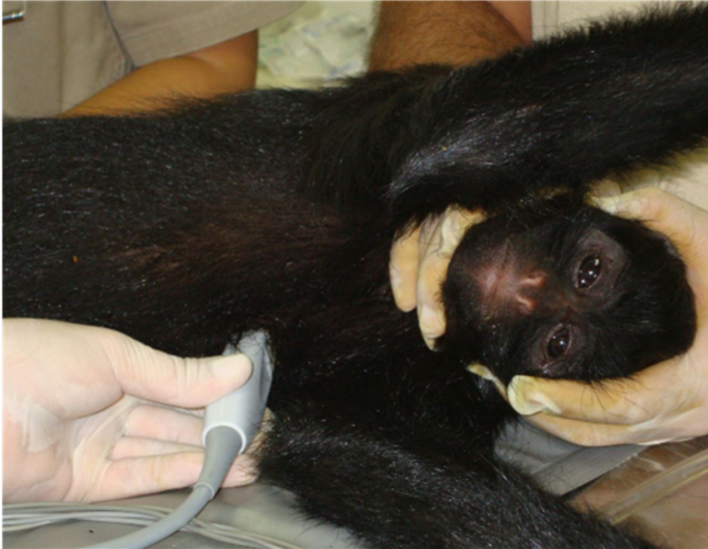
Figure 1. Echocardiographic examination in a specimen of the Ateles genus. Patient sedated in the left lateral decubitus. showing the positioning of the transducer in the region of the fourth left intercostal space. at the elbow. to obtain the anatomical echosonographic cuts.

After the examinations, the animals were sent to the observation room until full anesthetic recovery. Thus, the data were compiled and evaluated using the aforementioned descriptive statistics in order to assess the echocardiographic findings for future studies in this species.