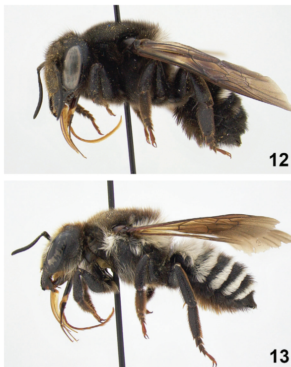
Figs 12–13. Megachile (Chalicodoma) albocristata Smith, 1853, females, general view.

The present contribution adds six species new to the fauna of Russia: Hoplitis curvipes , Osmia cinerea , O. ligurica , O. cyanoxantha , Protosmia glutinosa , and Coelioxys mielbergi ; however, the taxonomic status of the latter species is still unclear. Three species of the fauna of Russia are re-identified: Hoplitis turcestanica is resurrected from synonymy with H. caularis , Megachile albocristata and M. alborufa are newly listed instead of M. lefebvrei