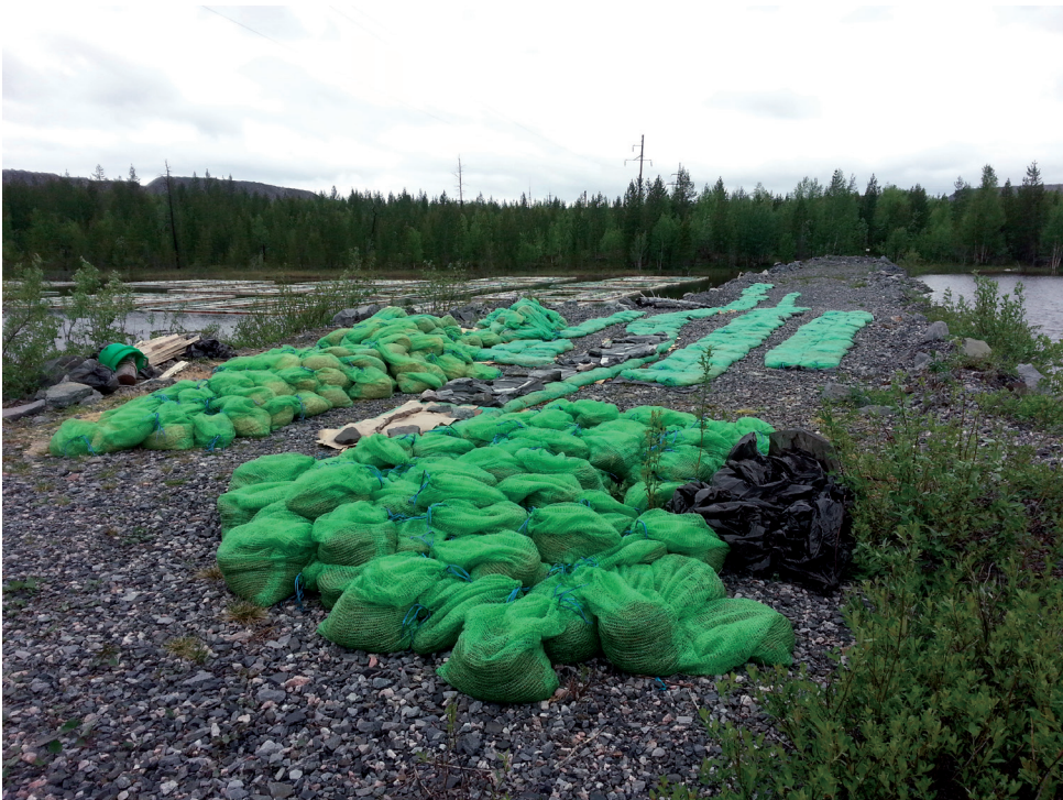
Fig. 2. The plastic mesh bags consist of sawdust, thermovermiculite, and seeds mixture

- Plant blocks of type II are for creating plant communities in the backwater or shallows. The nutrient organic-mineral substrate