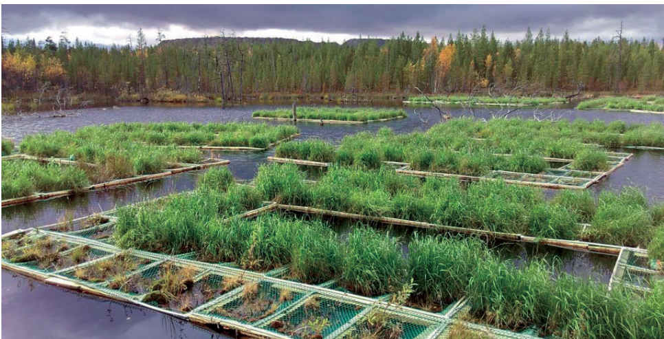
Fig. 1. Floating clusters of bioplate

The first stage. At this stage, a new patented method for post-treatment of waste quarry waters using the floating bioplate was developed and introduced (Evdokimova et al. 2015). It is represented by the floating clusters of connected frames with biological loading (Fig. 1). It was experimentally established that the bioplate area should be at least 40% of the total area of the treated reservoir for more rapid and effective treatment of the reservoir from nitrogen compounds (Evdokimova et al. 2016).