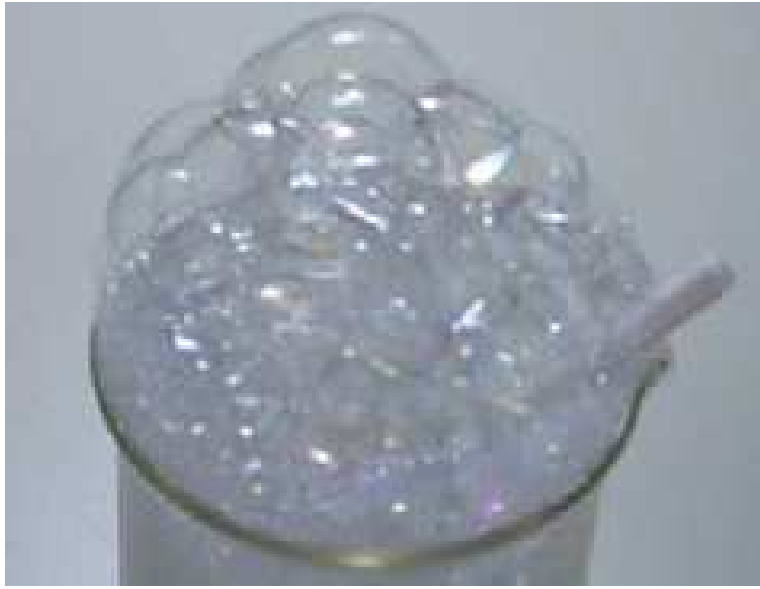
Figure 1. A pictorial presentation of the bubble void structure of our universe. On the surface of the bubble, matter galaxies are formed, while inside one bubble, neutrinos do exist.

m_{\nu 2} = 0.01 \text{ eV} and m_{\nu 3} = 0.06 \text{ eV} . These masses are the lowest mass allowed for neutrinos. The mass of m_{\nu 1} is not provided by the oscillation experiment itself, so I have assumed it by the analogy of the mass difference between charged leptons, e : \mu = 1 : 200 .