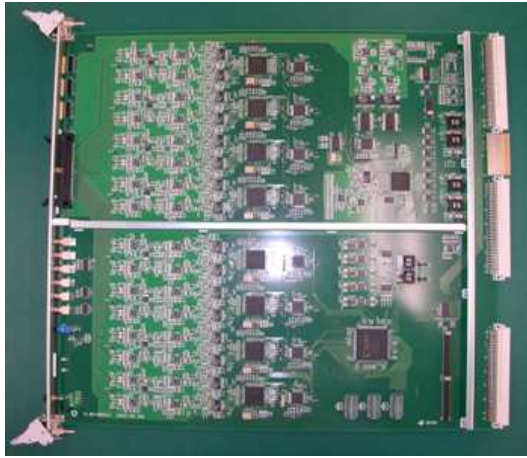
Figure 3. a picture of 2nd prototype SDF