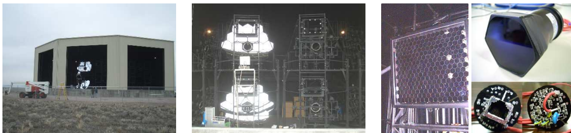
Figure 1. FD station (left), mirror (middle), PMT camera with pre-amplifier (right) for fluorescence measurement.

We will distribute 576 SDs in 1.2 km mesh and total covering area will be 760 \text{ km}^2 . Each SD is two layer of plastic scintillator of 3 \text{ m}^2 area and 1.2 cm thickness. The scintillation light is collected to PMT using wavelength shifting fiber. SD detects air shower particle directly.