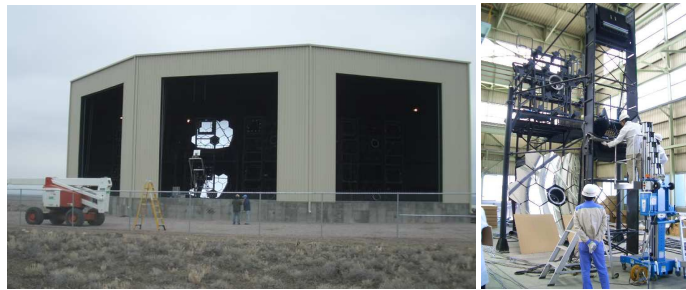
Figure 2. The left panel is an external view of the fluorescence detector station. In this picture the shutter is open, and then a telescope mount held segment mirrors is seen. The right panel is a close-up view of a telescope mount. The lower part of it held segment mirrors and an imaging camera. The picture was taken at a workshop of a production company in Japan.

a 12" light corrector with a 3/4" PMT, a CCD camera for monitoring clouds and data recording electronics. Every station has the LIDAR system, which installed 100m apart from the telescope building.