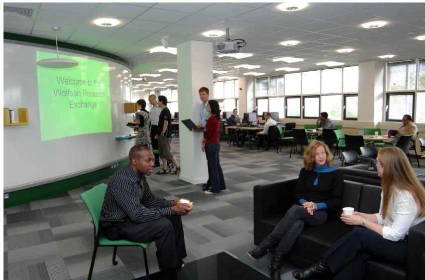
Figure 2: The Wolfson Research Exchange as viewed from the entrance.

figure 1 and also visible in figure 2) there are also a number of plasma screens and projectors which project directly onto the white surface of the wall. These screens are used to advertise events or news relevant to our researchers and our users can also use these facilities for projecting their work to facilitate any groupwork taking place. The surface of this wall is also magnetic and as such there is a small range of magnetic furniture including poster holders and book shelves, which can be transposed on its surface. The layout of the room along with part of the creative wall can be seen in figure 2.