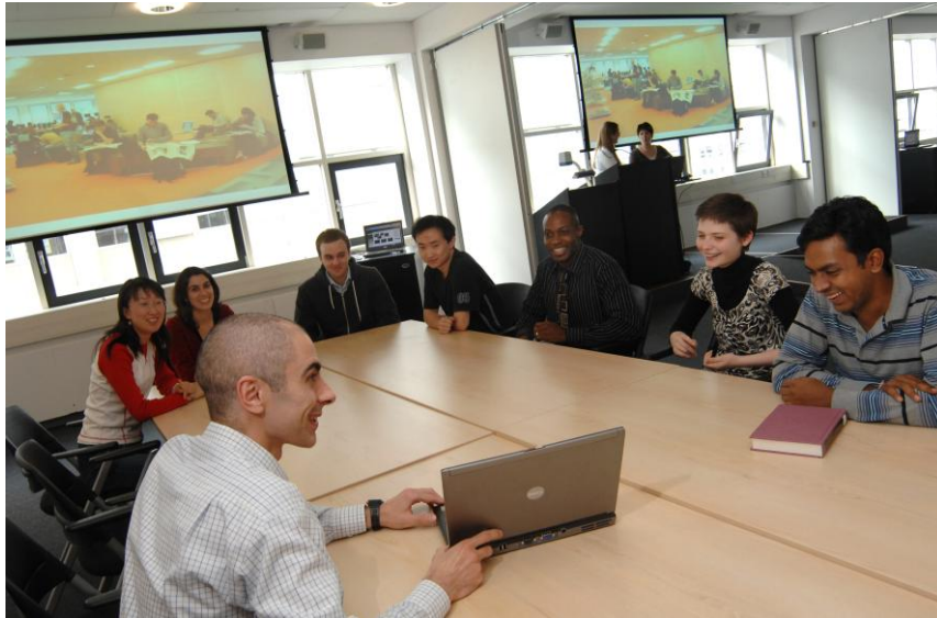
Figure 3: An event in one of the Research Exchange seminar rooms.

conferences or workshops. The walls between these rooms are also retractable so that we can offer users the option of three, two or one room for their events, holding up to around ninety participants in total.