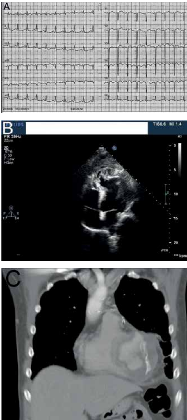
Figure 1. (A) ECG images show a cicatricial changes of the LV myocardium. (B) TTE images show a floating structure was located in the apical area (patch), with pseudoaneurysm formation about 30 cm 2 , filled with heterogeneous, loose, hypoechoic thrombotic masses and floating in the LV cavity vegetations. (C) Chest contrast CT images show a thrombotic masses in the LV cavity, detachment of the synthetic patch with the formation of a false aneurysm.

or operation. During an examination in November 2011, according to the cardiac echo, vegetations were found on the IVS, and therapy with antibiotics was started. In December, increased body temperature began to be