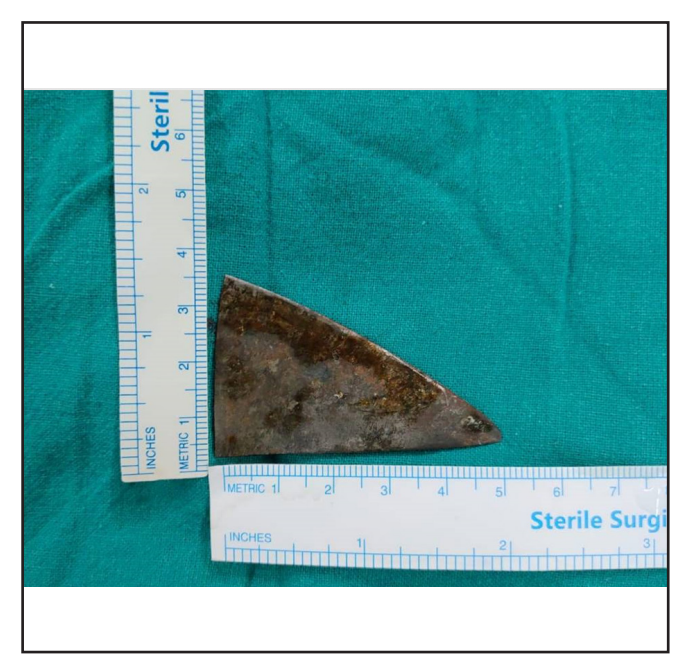
Fig. 3. Metallic foreign body after removal

ENT - Ear, Nose and Throat RAPD- Relative Afferent Pupillary Defect