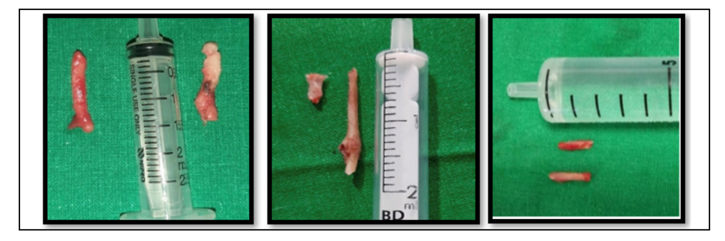
Fig.3. Post operative specimen of styloid process after tonsillo-styloidectomy

with oral antibiotics and analgesics, followed up on day 7, day 14 and 1-month following surgery and she showed prompt relief of symptoms.