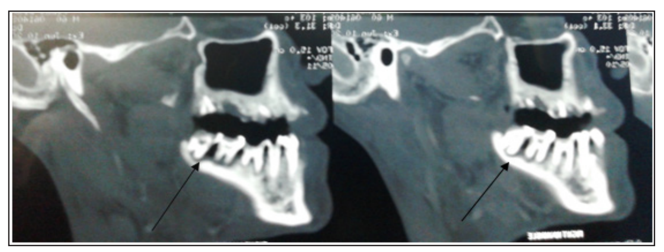
Fig.2. C.T scan of oral cavity showed radiolucent area of bone loss around lower right 2nd and 3rd molar teeth but absence of any adjacent soft tissue mass lesion that has caused mandibular bone destruction or cortical expansion.

Scope of using hyperbaric oxygen was not available in the institute therefore sequestrectomy was done and the patient was subjected to antibiotics, zolindronate