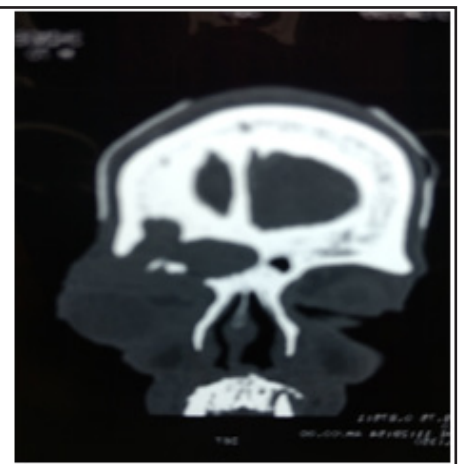
Fig. 2. CT shows non-enhancing soft tissue density lesion involving right frontal and ethmoid sinuses