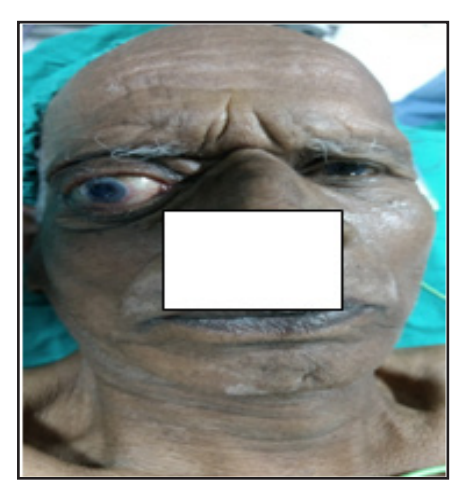
Fig. 1. Patient with proptosis of his right eye and displacement of the globe inferiorly