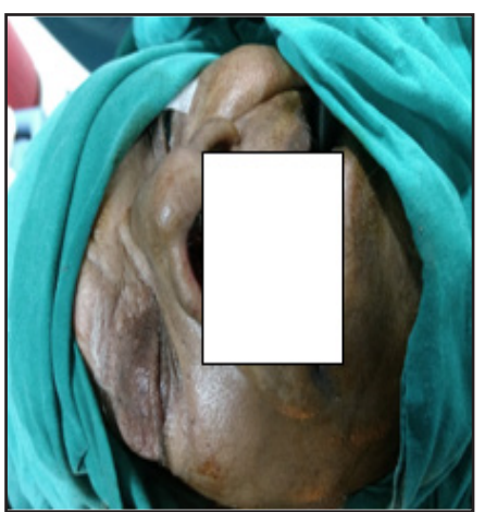
Fig. 4: Eyeball after drainage of mucocele