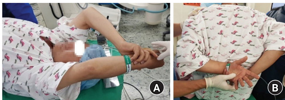
Fig. 4. (A, B) The patient was instructed to initiate passive exercise programs right after manipulation under anesthesia to maintain the restored range of motion, in which forward elevation and the backside arm-curl maneuver were emphasized.

Values are presented as mean ± standard deviation or number (%).