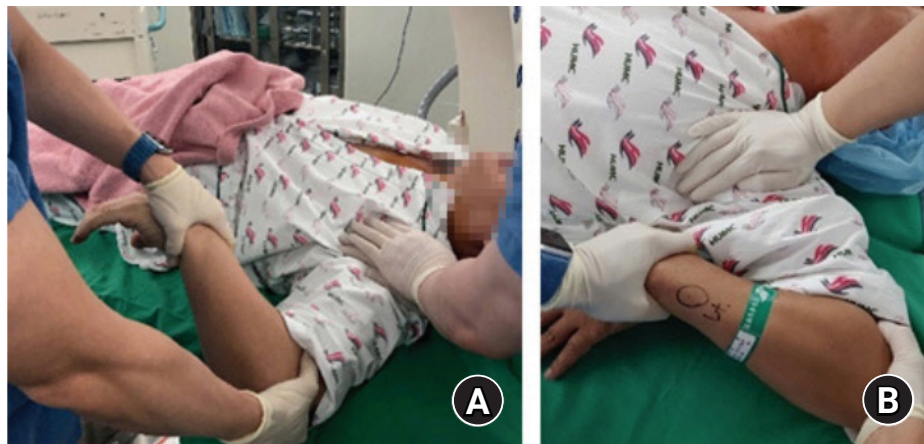
Fig. 1. (A) Internal rotation with the arm at 90° abduction, with the assistant pushing the shoulder girdle downward toward the floor was performed to complete the posterior and inferior capsule tear. (B) With 90° abduction with full internal rotation, further abduction can result in further capsular release with an audible sound.

In group B, manipulation preceded arthroscopic procedures and was performed at forward elevation only for the safe release