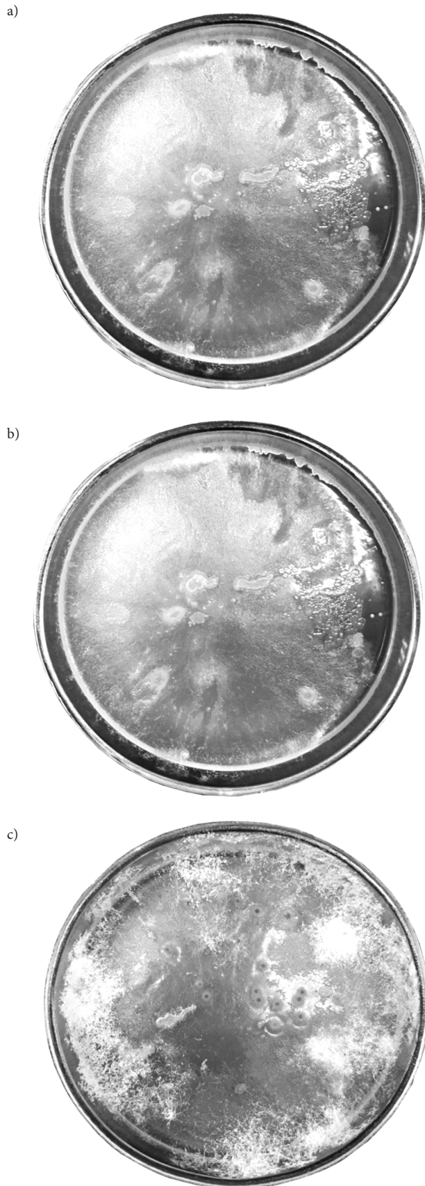
Figure 2. Microbiological analysis of the polluted arctic soil samples: a – 1, b – 2, c – 3 respectively