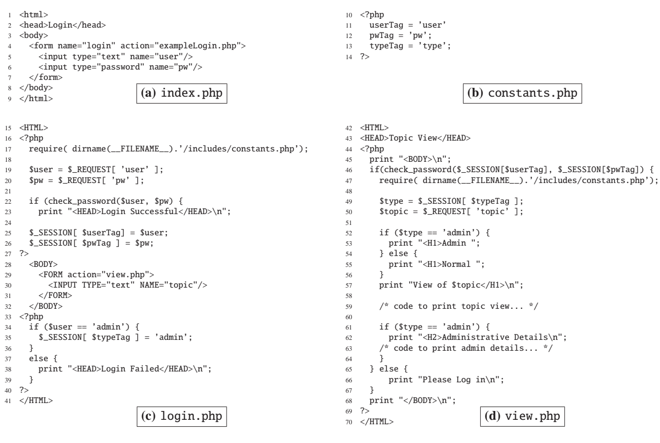
Fig. 4: Example PHP web application.

state, which will finally generate HTML exhibiting the fault as is shown in Figure 5(a). Thus, finding the fault requires a careful selection of inputs to a series of interactive scripts, as well as making sure updates to the session state during the execution of these scripts are preserved (I.e., making sure that the execution of the different script happen during the same session).