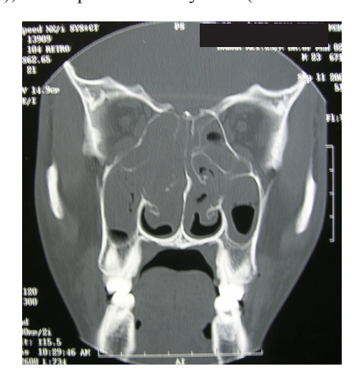
Fig. 1 Coronal CT scan of PNS showing a homogenous opacity in both nasal cavities, maxillary antra, anterior and posterior ethmoidal cells

CT scan of nose and paranasal sinuses (Fig. 1) revealed a homogenous mass in both maxillary antra and nasal cavities. Nasal endoscopy revealed mass in both nasal cavities; biopsy taken from the mass and endoscopic debridement of the mass was done with the help of a microdebrider. Histopathological examination of the mass suggested necrotising vasculitis and granuloma formation of small vessels (Fig. 2). His routine blood examination revealed anaemia (Hb. 8 gm %), neutrophilic leukocytosis (total count- 23000/