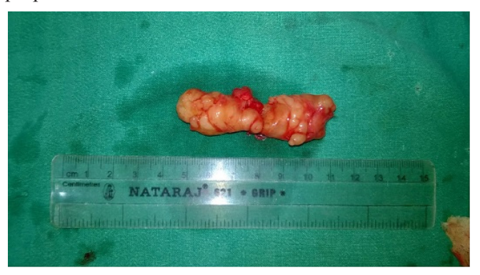
Fig. 3 Macroscopic view of the tumor

Verocay in 1910 first described a group of neurogenic tumours, termed as 'neurinomas'.<sup>4</sup> In 1935, Stout proposed that these tumours arose from nerve sheath