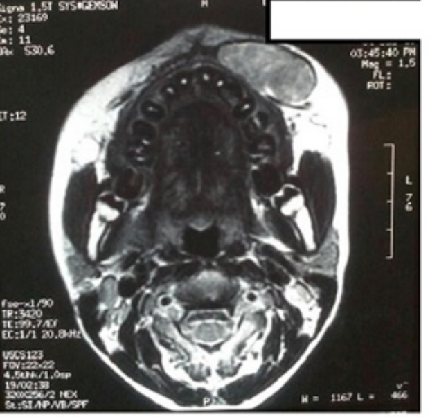
Fig. 2 Magnetic resonance imaging (axial and coronal views)