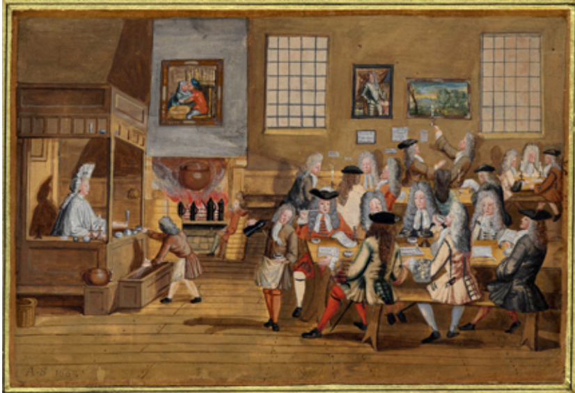
Illustration 1 Interior of a London coffeehouse, c. 1690-1700 (source: The British Museum , 1931, 0613,1).