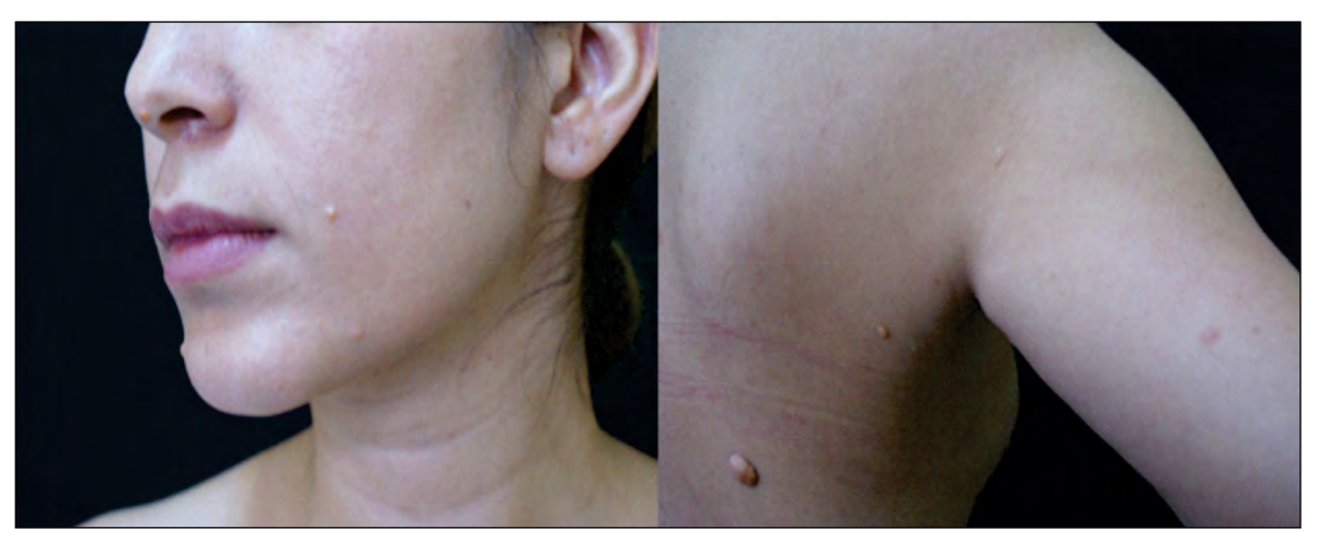
FIGURE 1. Multiple orange papules and nodules of different sizes, ranging from 0.5 to 2 cm located on the trunk, limbs and face