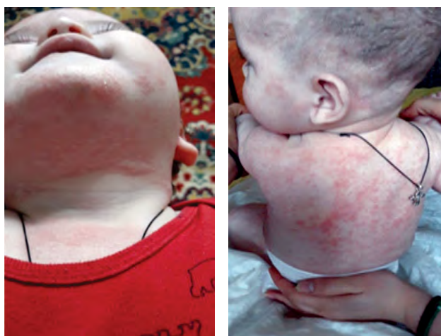
FIGURE 3. A 6-months-old boy with severe atopic dermatitis. His serum thymus and activation-regulated chemokine level were 1684 pg/ml

The results of our and other [30-31] studies indicate a dynamic increase in the prevalence of AD. In our studies, we confirmed the recommendations [32] to grade the severity of AD, while agreeing that the