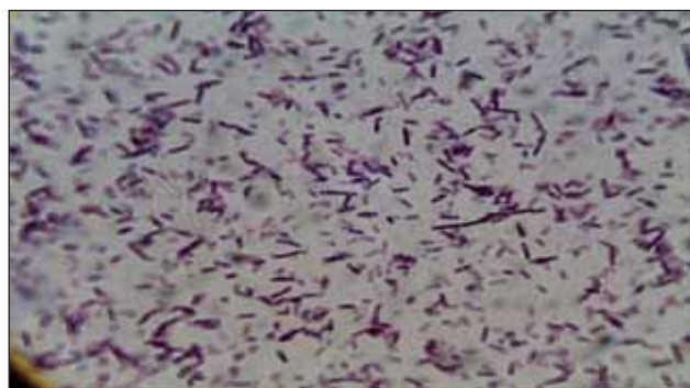
FIGURE 3. Gram staining smear – Clostridium difficile culture – optical microscopy

Gram staining (Figure 3) and biochemical characteristics, with positivity for indole and L-proline-naphthalimide tests. Positive presumption tests require confirmation by RapID ANA systems (rapid identification system of anaerobic isolates) or MALDI-TOF (matrix-assisted laser desorption/ionization– time of flight) (35). The identified strains of CD can be nontoxigenic (20-25%). After identifying strains of CD, it is necessary to assess the pathogenic potential using a toxigenesis test, CCNA, EIA or NAAT (3).