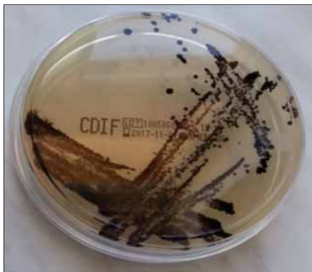
FIGURE 2. Culture of Clostridium difficile on chromogen-chromium medium C. difficile agar (bioMérieux) - black colonies

Presumption tests are run on suspected colonies: morphology of the colonies, the appearance in