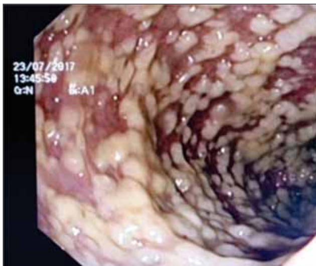
FIGURE 4. Colonoscopy image – Clostridium difficile infection, mucosal inflammation with yellow-coated deposits of 1-4 mm

Endoscopic methods, flexible sigmoidoscopy and colonoscopy are no longer due to fragile nature of the lining of the colon and risk of wall perforation (39). Colonoscopy and anatomopathological examination of surgical or necrotic specimens, can establish the diagnosis of CDI by revealing typical pseudomembranes, with yellowish deposits and pseudomembranes (Figure 4). Microscopically, microscopic examination describes the damaged epithelium with focal necrosis areas, neutrophilic infiltrate of the mucosa, and fragmented clumps of leukocytes, fibrin, mucus and cell detrituses (10,16).