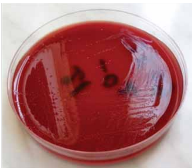
FIGURE 1. Culture of Clostridium difficile on agar-blood medium, with non-haemolytic colonies, matte surface and diameter of 2-4 mm

Anaerobiosis culture is achieved on selective agar media with cicloserine cefoxitin-fructose, after prior decontamination of the stool sample by treating with heat or alcohol. After a few days incubation at temperatures of 20-25° C, there may grow yellowish, planar colonies with irregular margins and the appearance of frosted glass. Culture sensitivity may be increased by up to 100% by using ChromoID medium, agar enriched with sodium taurocholate, egg yolk agar, trypticase soy and sheep blood agar (34) (Figures 1, 2).