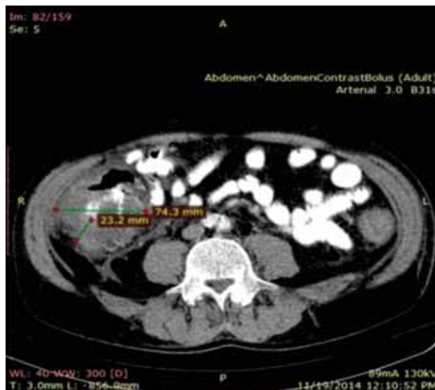
FIGURE 5. Abdominal CT-scan – Ascending colon - wall thickness of 23,2 mm, transversal diameter of 74,3 mm

Imaging methods are recommended for the diagnosis of CDI, when complications or other intra-abdominal pathologies are suspected. The most common aspect highlighted in abdominal CT is bowel wall thickening, to which ascites and bowel irregularity of the wall can associate (Figures 5, 6). The abdominal x-ray is indicated for early diagnosis of toxic megacolon, especially in patients presenting sepsis criteria (10,36).