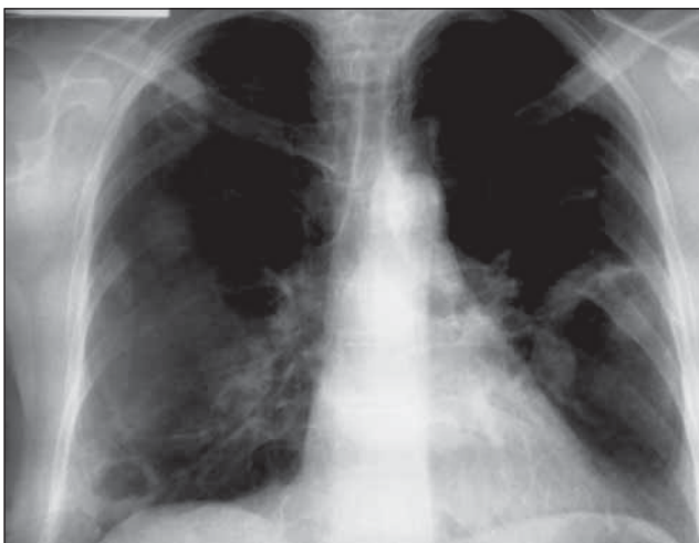
FIGURE 3. Chest X ray patient 2. Air-fluid images disseminated in both lung fields predominant right – pulmonary hydatidosis

The present pulmonary X-ray shows more nodular opacities in both pulmonary fields, predominantly in the right pulmonary field, two of them having a air-fluid level (Fig. 3).