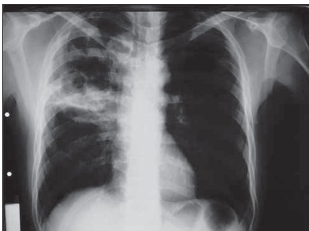
FIGURE 4. Postero-anterior radiography of the patient 3. Apical cavitory fibrocaceous tuberculosis

There is a clinical-radiological suspicion of pulmonary tuberculosis being performed a sputum examination; the rapid GeneXpert method that detected RMP sensitive Mycobacterium tuberculosis DNA. The positive diagnosis was secondary pulmonary tuberculosis, fibrocaceous-cavitory form.