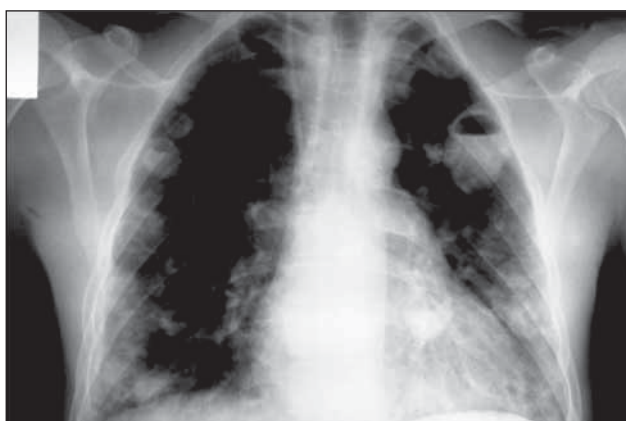
FIGURE 1. Chest X-ray patient 1 – Pneumatocele

Standard pulmonary radiography highlights: multiple alveolar opacities, some homogeneous, others with hydroaeric levels (pneumatocele) bilaterally diffused, laterotoracic, diameters 1-5 cm, suggestive of pulmonary staphylococcus (Fig. 1).