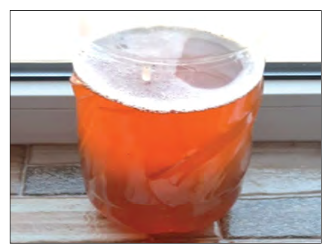
FIGURE 1. Collected urine with hematuric aspect

pressive tumor that might have led to these stenotic changes.