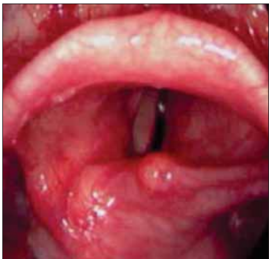
FIGURE 3. Endoscopic view of the larynx – day 7: right vocal fold paralysis with anterior plunging of the right arytenoid

complications and treatment adjustment. Differential diagnosis with other causes of bilateral vocal cord palsy in rheumatoid arthritis was carried out. Absence of skin ulcerations, purpura, ocular involvement, neurologic deficit and normal complement titers ruled out rheumatoid vasculitis. Cervical spine involvement was excluded by normal cervical radiography.