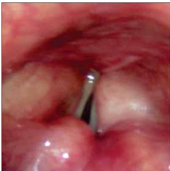
FIGURE 2. Endoscopic view of the larynx – 1st day: the arytenoids are plugged anteriorly and the vocal folds are immobilized in paramedian position. The right vocal fold has a concave aspect.