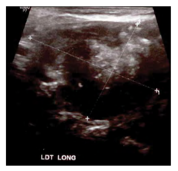
FIGURE 1A. Longitudinal aspect of right lobe with increase dimensions and suspect nodular conglomerate

This is a 76 year old non-smoking female resident in iodine sufficient area. She is known for the last three years with ultrasound-detected thyroid nodule with suspect features for thyroid cancer. Thyroidectomy was recommended at that time but the patient refused it. Currently, the thyroid ultrasound shows a right lobe of 3.3 by 3.2 by 4.3 cm, which is entirely displayed by a nodular conglomerate with hipoechoic, inhomogeneous pattern, containing several infiltrative images into the lobe and anterior capsule while posterior contour is shaded. The nodule is mobile during deglutition and it has very large diameters: 4.3 by 3.4 by 3.3 cm (TI-RADS 4C) (Fig. 1).