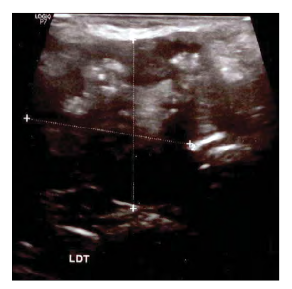
FIGURE 1B. Right lobe at thyroid ultrasound: 3.3 by 3.2 by 4.3 cm (inhomogenous, hypoechoic pattern, poorly shaped aspect)