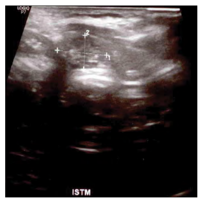
FIGURE 2. Thyroid ultrasound: istm with a nodule of 1.3 by 0.88 by 1.8 cm

The left lobe has 4-5 micronodules of maximum 0.52 cm. No local lymph nodes were detected. TSH (Thyroid Stimulating Hormone) is normal, so is blood calcitonin, and anti-thyroid antibodies. Despite the high malignancy risk based on fine needle aspiration pointing a papillary carcinoma, the patient still refused thyroid removal.