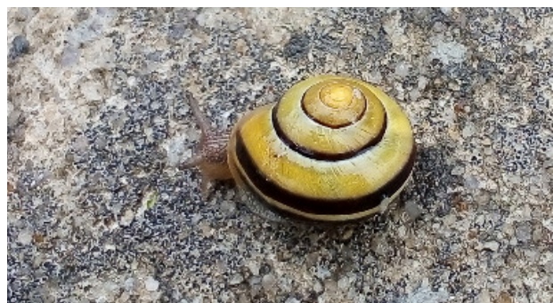
Fig. 1. Cepaea nemoralis from Horní Blatná.

The species occurrence was not confirmed in the centre of Přebuz, seven isolated houses in Ryžovna and several examined places in Hřebečná (Fig. 2).