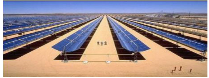
Fig. 1. NOOR 1 (Concentrated Solar Power) installation.

temperature above its minimum working temperature (8 °C for synthetic oil) and to power the pumps during the night to ensure the circulation of the oil in the circuits.