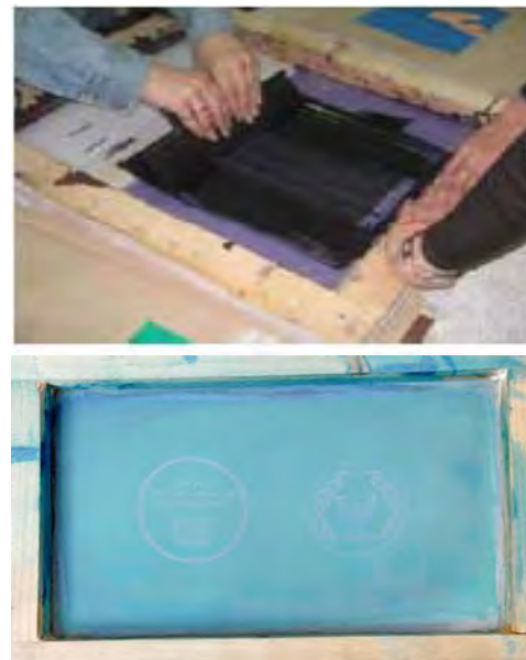
Fig.7. Applying the ink to the screen.

Areas of the screen are blocked off with a non-permeable material to form a stencil, which is a negative of the image to be printed; that is, the open spaces are where the ink will appear.