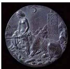
Fig.1. Designed by Pisanello 1447.

Until the seventeenth century, medals were often used as articles of personal adornment, attached to clothing or worn around the neck. As intimate sculpture in a double-sided relief format, medals have always been something to hold and turn into hand-personal objects for aesthetic and intellectual contemplation.