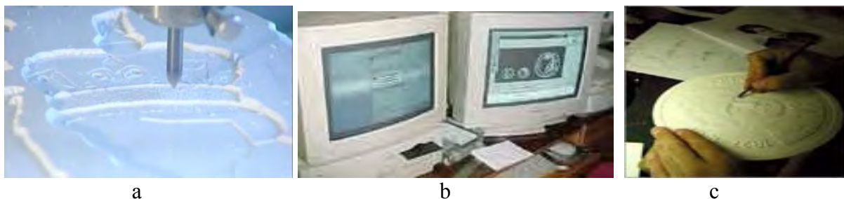
Fig.4. Modeling technique: a. mechanical, b. computers, c. manual

The model then will be cast in plaster and reduced to the proper size using a special reducing pantograph and will then be used to produce the pressing.