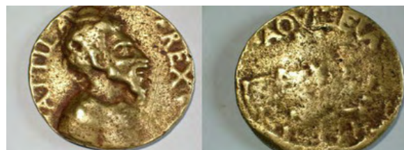
Fig.2. Aquila city commemorative medal.

The first great artist to create medals was the Italian painter Antonio Pisano, known as Pisanello, who modeled and cast a number of portrait medals of princes and scholars in the 1440s.