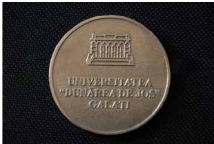
Fig.8. University "Dunarea de Jos" medal

In order to avoid damage to the area that does not have printed image that is the inverse of the border and the next model are covered with the same paint. The medal on one of the sides is introduced in nitric acid. The achievement of care forms can lead to high-quality products.