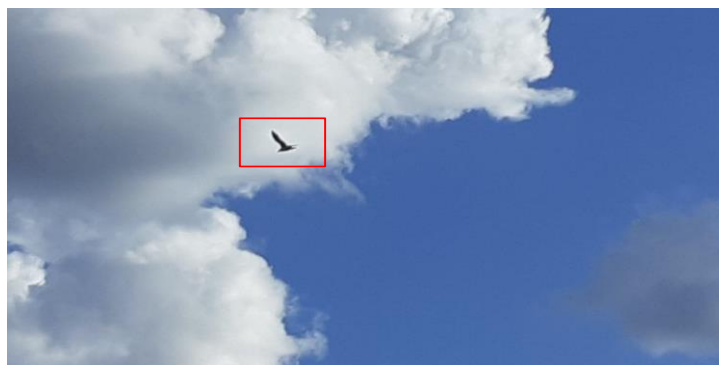
Fig. 5. Detection of bird