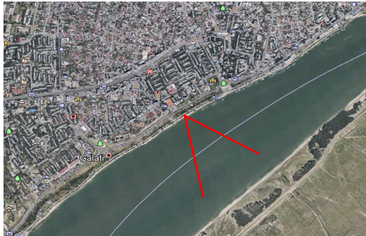
Fig. 3. Cameras Field of View

The neuronal networks analysis is able to classify the objects and exclude those that are not birds. The birds are marked with a rectangle (Fig. 4 and 6), regardless of the wing positions.