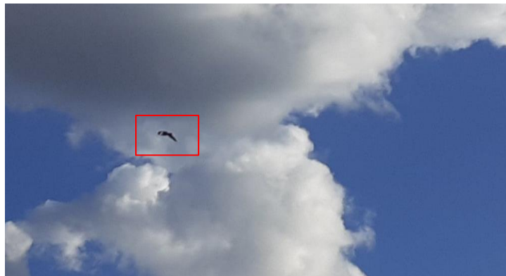
Fig. 4. Detection of bird