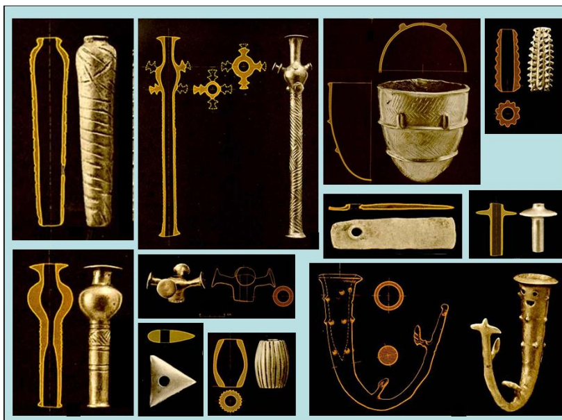
Fig. 5. Some examples of artifacts types from the Nahal Mishmar's treasure

In parallel, it should be emphasized that the combination of primitive art, religion and metallurgy is striking in this case. Many of the artefacts were made by Lost Wax Casting process. Also, additional procedures were used: casting in open forms, casting in closed forms, etc. Several types of artefacts and their sections are shown in Figure 5.