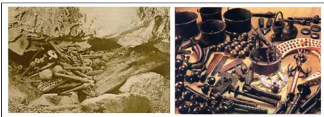
Fig. 3. Treasure of Nahal Mishmar: left: at finding time; right: after preservation

In this cave were discovered 442 objects, wrapped in a mattress of straw, a real treasure (Fig.3).