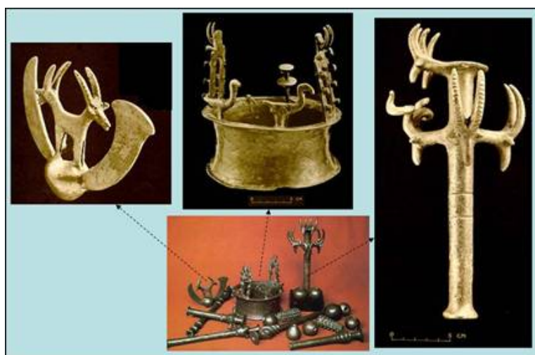
Fig. 4. Examples of artifacts from the Nahal Mishmar's treasure

hematite, five of hippopotamus ivory and one of elephant ivory. Their esthetics is exceptional and they are so sophisticated that in many cases modern artisans are surprised. The shape and decoration of each artifact is unusual. Many are so strange that they defy accurate definition. An additional aspect: each artifact is in itself unique, given that there are no two identical objects.