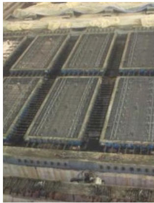
Figure 3. Matrix pedestal method.