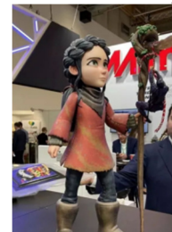
Figure 6. 3D color printing model.

Based on its unique advanced UV inkjet printing technology, Japan Mimaki launched the 3DUJ-553 full-color 3D printer in 2017, which is the world's first 3D printer that provides more than 10 million colors. The 3D color printing model is shown in Figure 6.