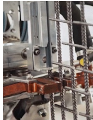
Figure 4. Rebar automatic binding robot.

(2) The development of intelligent manufacturing robots