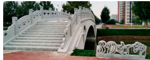
Figure 5. Concrete 3D printing Zhaozhou Bridge.

3D printing technology, also known as additive manufacturing technology. The typical application in the field of civil engineering is the concrete 3D printed arch bridge, as shown in Figure 5. The prefabricated concrete 3D printed Zhaozhou Bridge draws on the construction experience of the built 3D printed buildings, and introduces BIM virtual simulation technology and modern intelligent monitoring methods.[8]