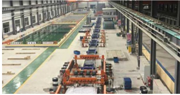
Figure 2. Unit flow method.