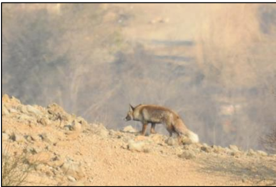
Figure 5: Red fox at Photaki site during its diurnal activity.

In the grasses Cynodon dactylon (IVI= 142.23) and Lilihe spp. (IVI= 9.73) were the most and least frequent species. These species provided adobe in the same manner. Among trees: Morus alba , shrubs: Adhatoda zeylanica and herbs: Typha spp. , Parthenium hysterophorus , Launaea procumbens , Rumex obtusifolius , Euphorbia helioscopia , Malva neglecta could not be found at this site.