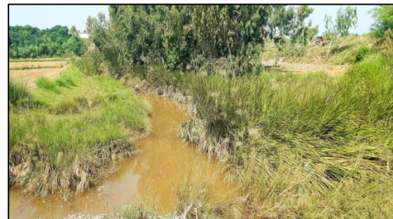
Figure 2: Habitat of red fox at Devi site. There were agricultural fields but undisturbed side-patches provided a red fox suitable habitat.

For habitat characterization samples of trees, shrubs and herbs species of both study sites were collected, identified and preserved on herbarium sheets as reference materials. For trees, shrubs and herbs species, data were recorded following quadrat-count Method (Haggett et al., 1965; Diggle, 2003). Quadrats were laid out randomly in each sampling site. For trees 10 m x10 m, for shrub species 4 m x 4 m and for herb species 1 m x 1 m quadrats were established to calculate density, frequency, cover and for calculation of importance value index (IVI).