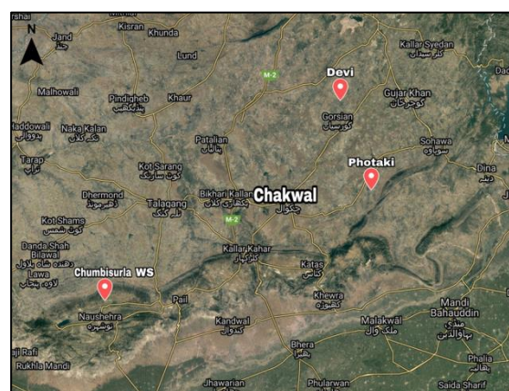
Figure 1: A satellite image showing location of the three selected study sites namely Devi, Photaki, Chumbisurla Wildlife Sanctuary (CWS) in District Chakwal, Pakistan.

Chakwal (32.9328° NL, 72.8630° E; Pothohar Plateau) is hilly country with reddish-brown soil. The environment is arid and cool, with sub humid climate. This area comprises of hilly undulates, with sandy patches (Chaudhry, et al., 2001). Almost 80% of human population lives in rural areas (Figure 1).