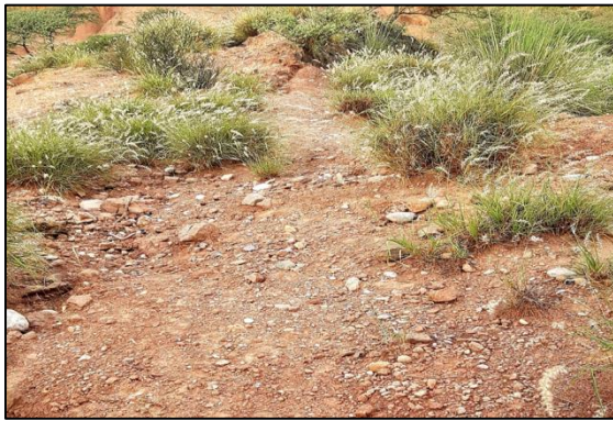
Figure 1: Topography of the Photaki site. Soil of the area is reddish-brown with mountainous and stony patches.

Potential sites were selected on the basis of preliminary surveys and visited on weekly basis between November, 2013 and November, 2014, with a total of 96 field hours.