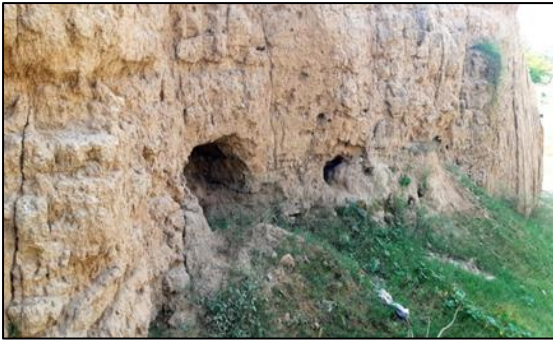
Figure 4: Red fox den at Devi site located at the unreachable place.