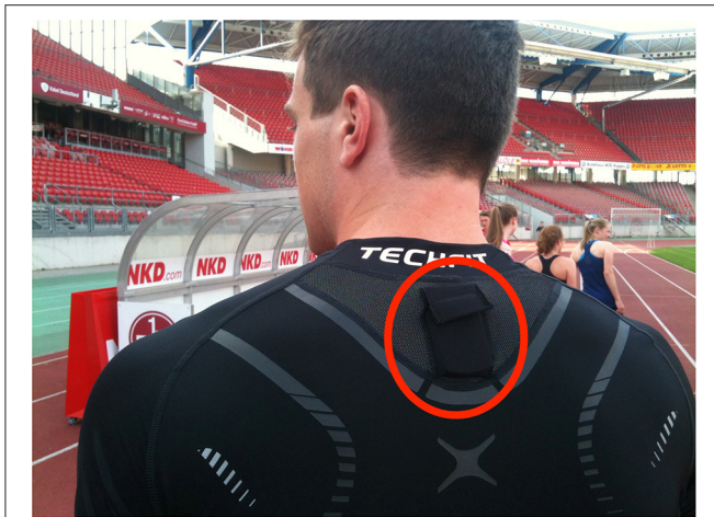
FIGURE 1 | Transmitter placement on the athletes. Transmitters were placed inside a specially designed pocket.

Based on these assumptions, we propose the following procedure to derive TSI parameters from raw tracking data that will be described in detail below: